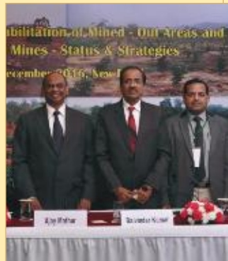
IBM, TERI Workshop deliberate SDF