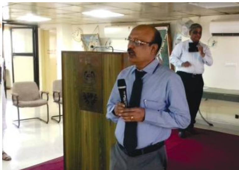
The officers and employees of the Indian Bureau of Mines participated enthusiastically at a lecture programme on Cashless Transactions held at IBM HQ, Nagpur. The officials of UCO bank conducted the lecture programme.