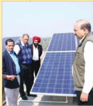
Secretary, Joint Secretary visits IBM, Nagpur