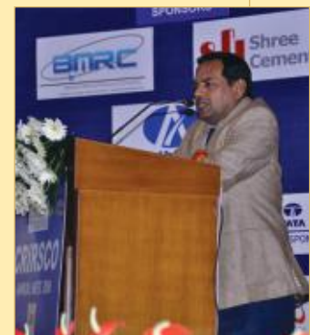
CG delivers talk at CRIRSCO Annual meet