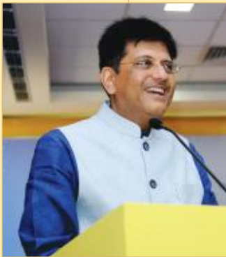
Union Minister Piyush Goyal launches MSS project