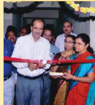
Renovated Chemical Lab opened at Bengaluru